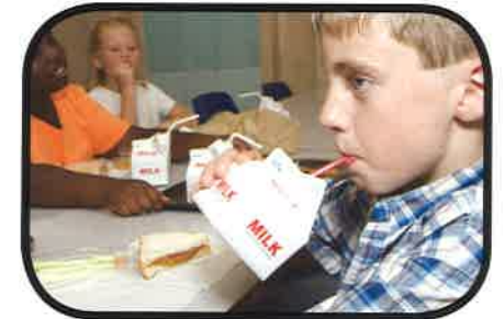
Meals and Snacks