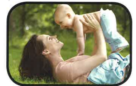
Women, Infants and Children (WIC)