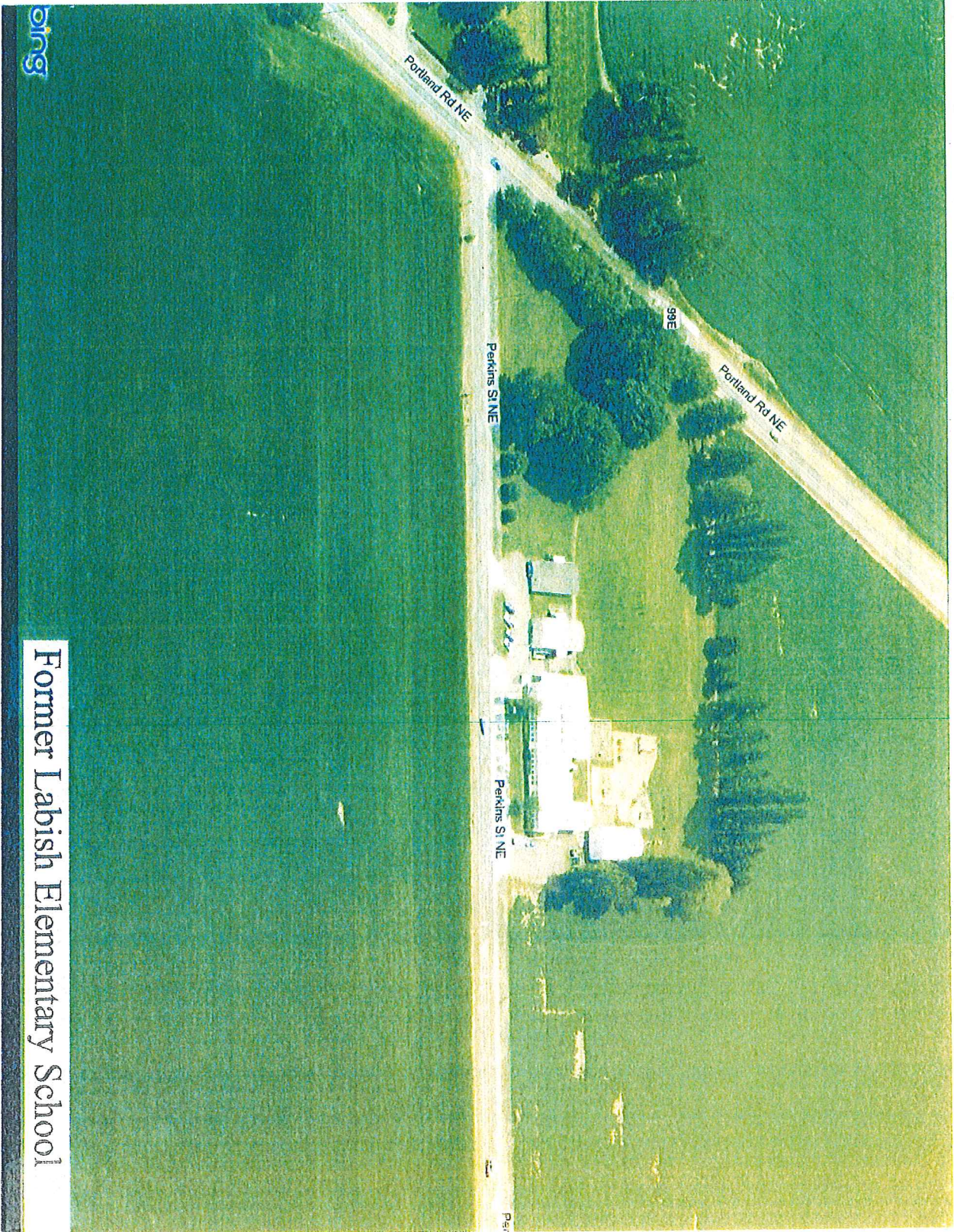
Former Labish Elementary School