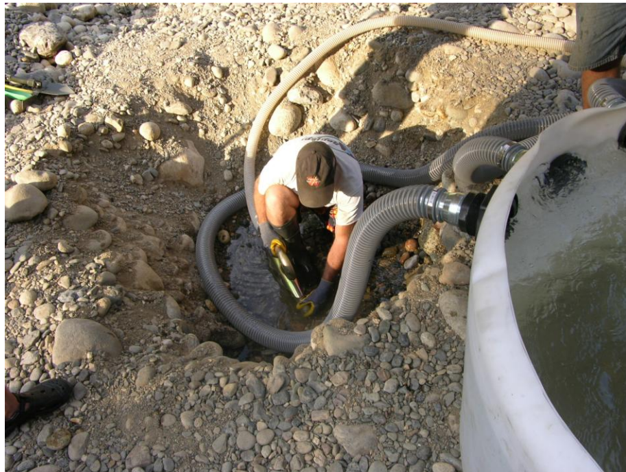
This is not a small-scale gold suction dredge although it was used as a surrogate for one in this California gold suction dredge study onshore beside the Yuba River

Below are photographs of the Fleck (2011) mercury hotspot suction dredge and the one hole from which the sample was collected. This single tub of water is what is being used in the SEIR to define mercury contamination from all suction dredges working the waters of California.