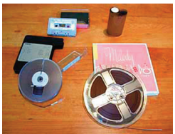
Legislative audio tapes at the State Archives.

7a). The information contained in the original records at the State Archives is the most direct evidence of the actions of government since it was created in the course of business.