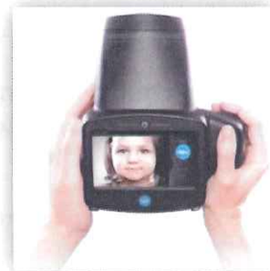
PediaVision SPOT Photo Screening Device