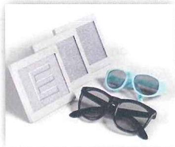
Random Dot E Stereo Vision Test