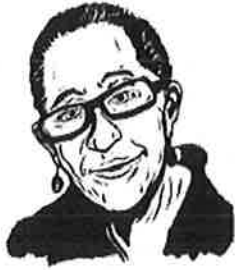
Illustration: Chris Cech