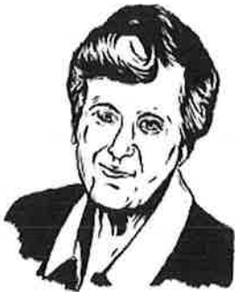
Illustration: Chris Cech

The "grocery store maverick" founded local independent Zupan's—and helped pave the way for shelves stocked with high quality, organic foods.