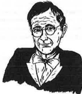
Illustration: Chris Cech

The philanthropic and arts advocate served on the Portland Art Museum's board for 15 years.