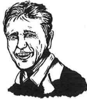
Illustration: Chris Cech

From the Museum of Contemporary Craft to the Portland Institute for Contemporary Art, the culture scene benefactor seeded the art scene with money, sweat equity, and spirit.