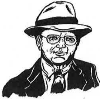
Illustration: Chris Cech