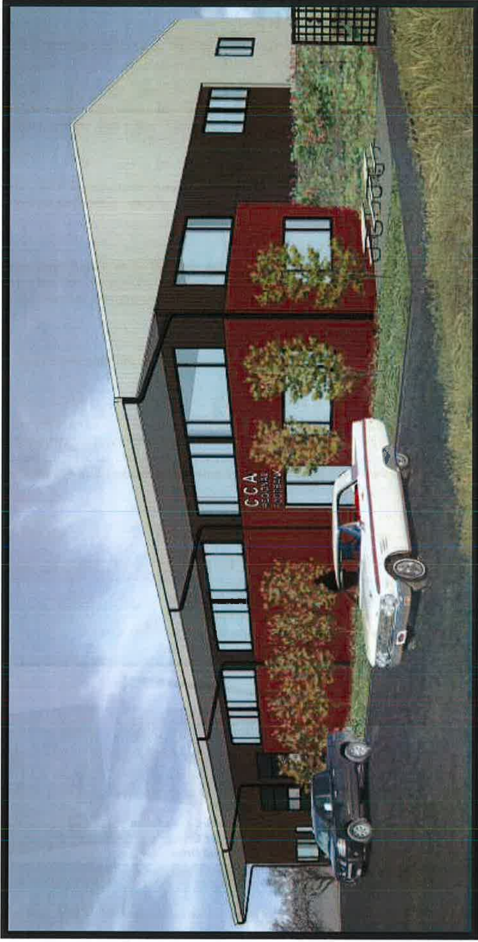
Architectural rendering of the new CCA Regional Food Bank Distribution Center 2010 SE Chokeberry Avenue ~ Warrenton, OR 97146 Completed: October 19, 2009 Everyone is welcome to visit us