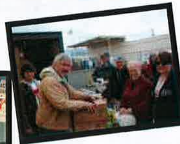
2010 National Association of Letter Carrier's Food Drive