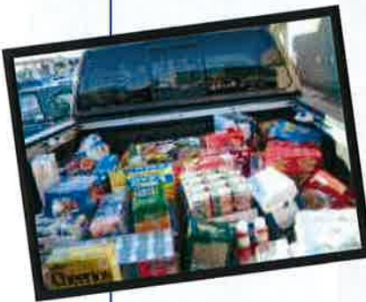
2010 Weathering the Storm Food Drive Columbia River Maritime Museum

CCA Regional Food Bank is an Equal Opportunity Provider