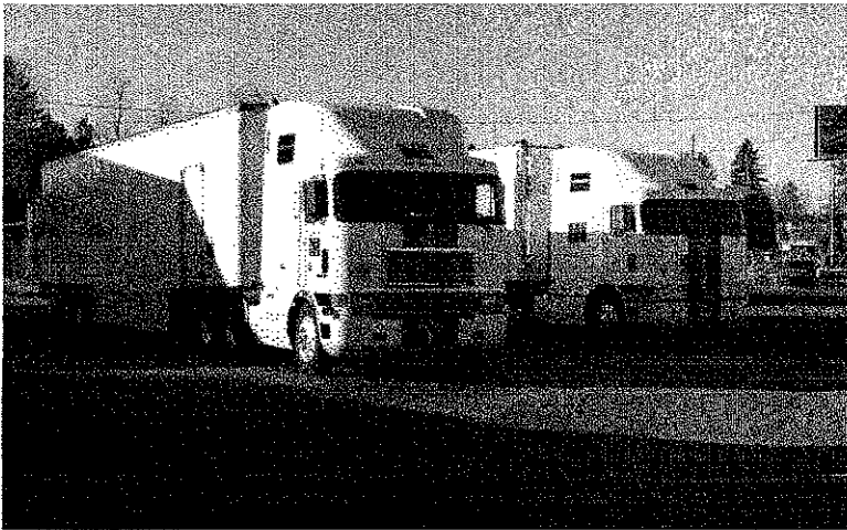
STP Tractors pulling BLT 48 and BLT 35