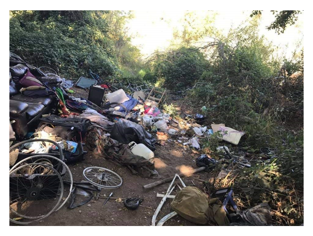
Piled up garbage left by Transient Campers along Bear Creek, Medford