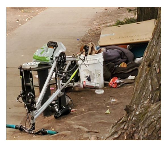
Hawthorne Park 2022 & 2023