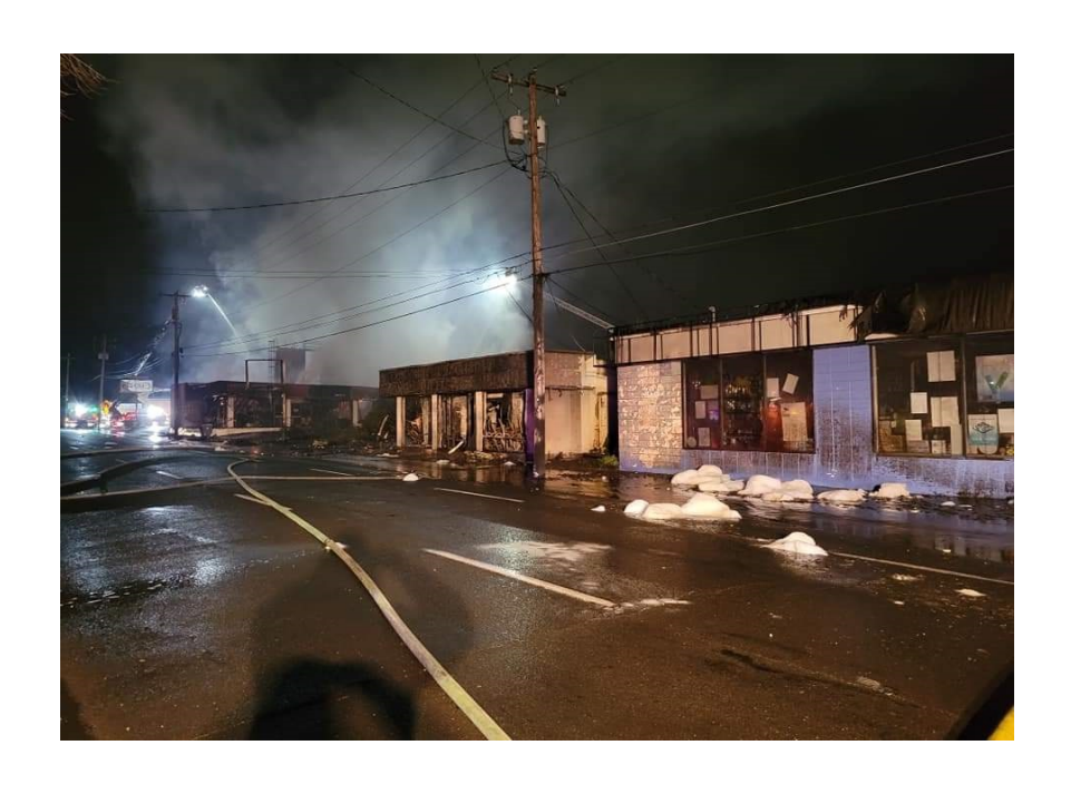
Pacific Pride Arson Fire 4-2022 & the resulting oil and chemical damage to Bear Creek by Hawthorne Park